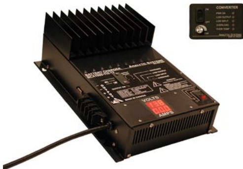
(Shown with Optional Digital Meter)